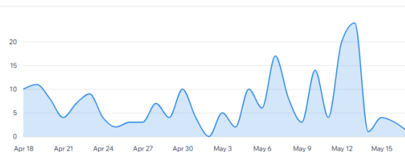
Sessions over time